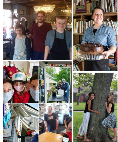
Awardees: Perky Planet Café, Miss Weinerz, Stow Street Café, and Waste Free Earth